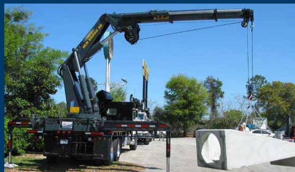
Hydraulic Extension: 3S - 5S