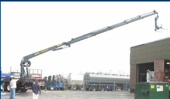
Hydraulic extension to 24 mtr tip height reach. Tip height reach and 1 manual pullout to 26 mtr