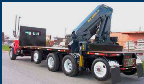
Hydraulic Extension: 2S - 3S - 5S