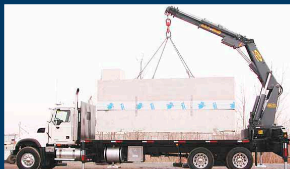
Hydraulic Extension: 3S - 5S