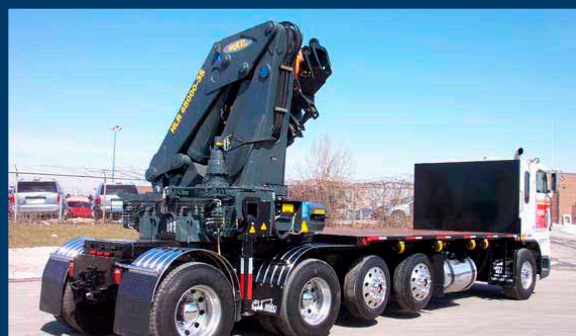
Hydraulic Extension: 5S - 6S