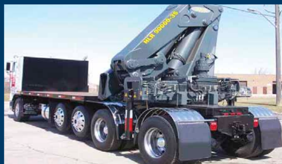
Hydraulic Extension: 3S - 5S