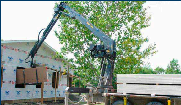
Hydraulic extension to 20 mtr tip height reach