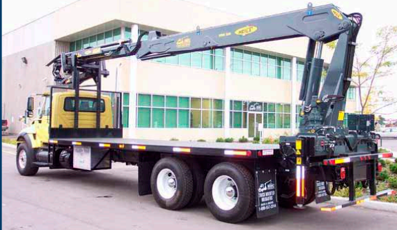
Hydraulic extension to 15 mtr tip height reach