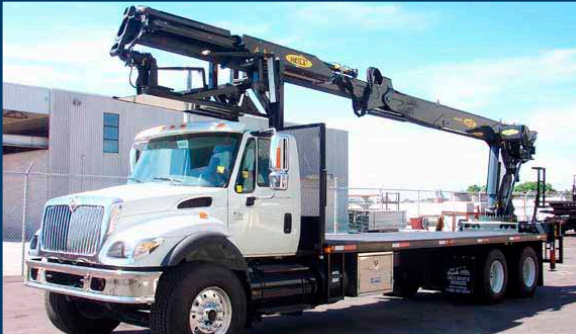
Hydraulic extension to 17 mtr tip height reach