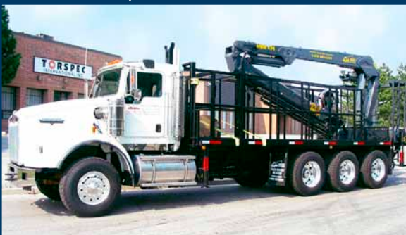
Hydraulic extension to 23 mtr tip height reach